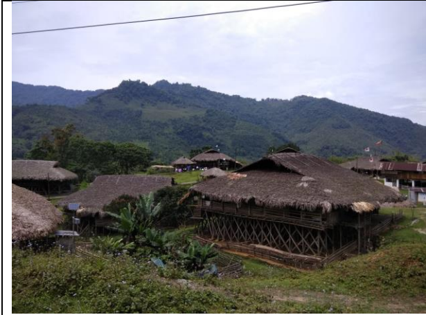
A typical Adi village