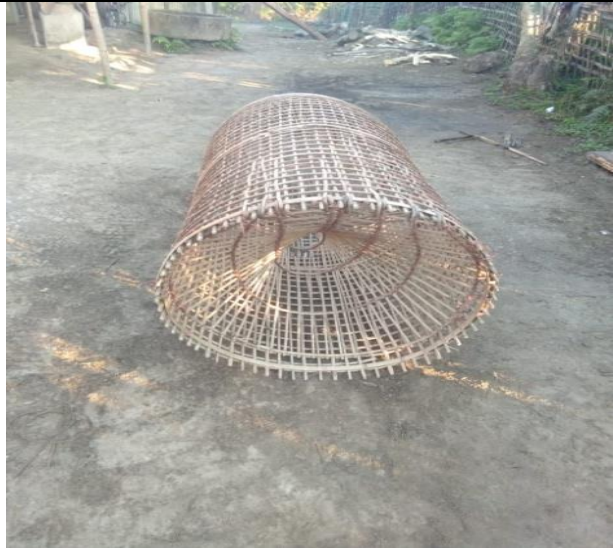
Horizontal view of Dirdang