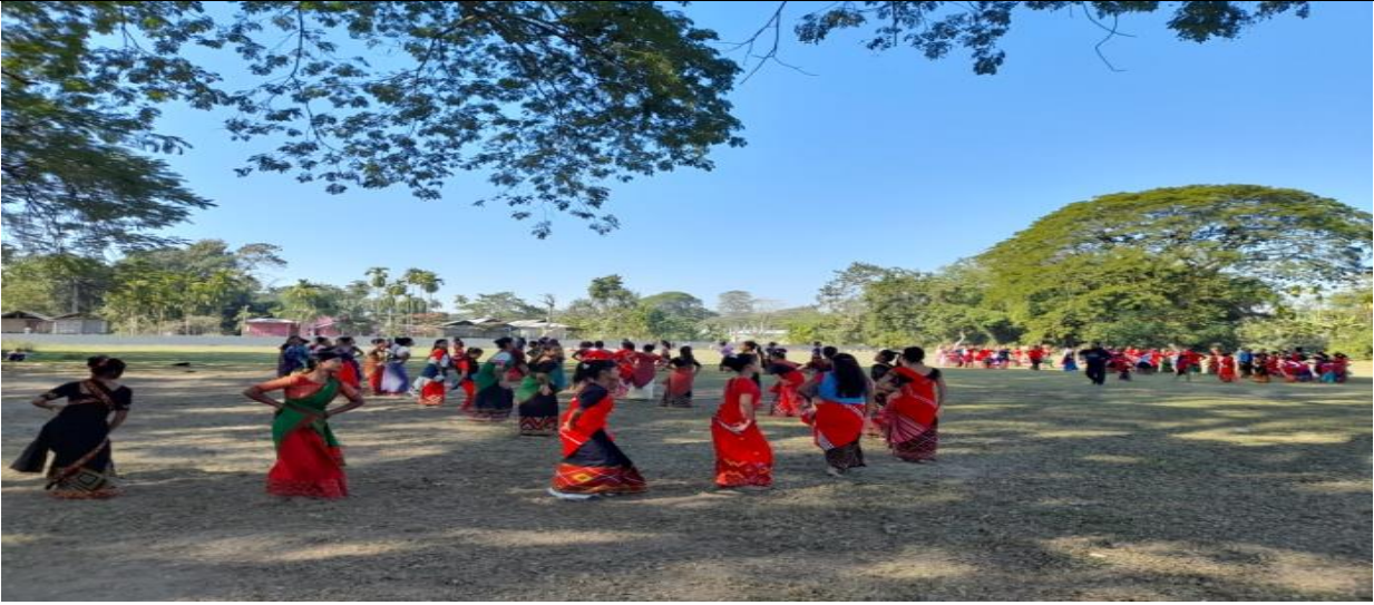
Photograph of workshop on Gumrag dance organized by Mising dirbi kebang