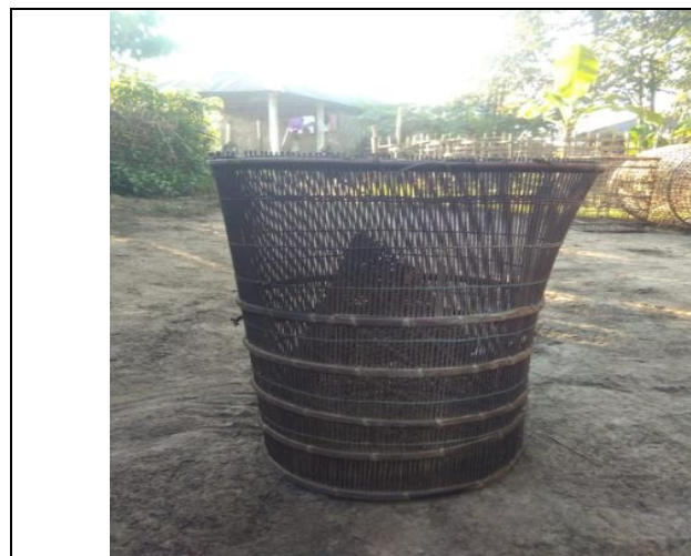
Vertical view of Dingora