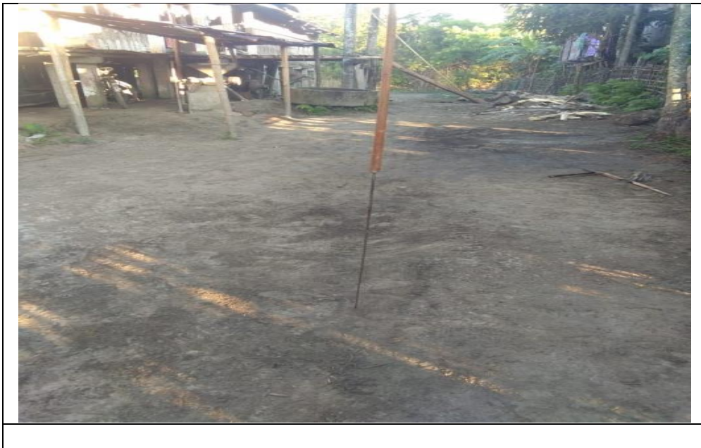
Photographs of Fishing implement