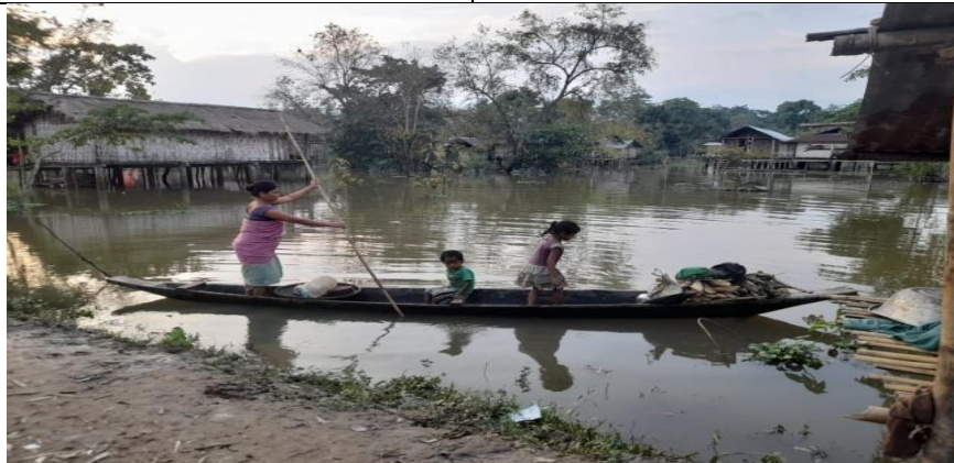
Photographs of a flooded Mising village