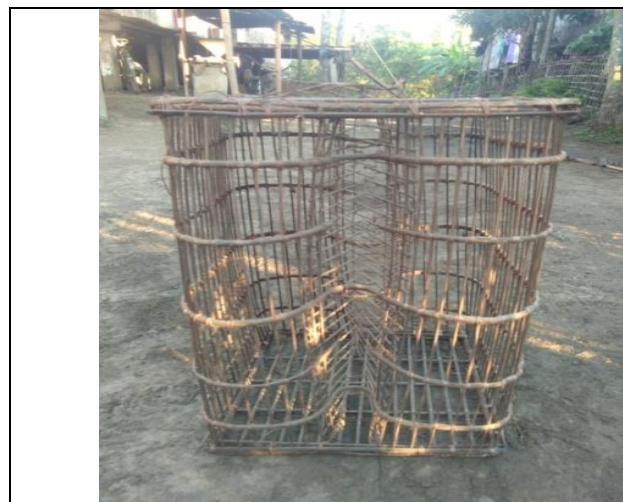
Front view of Koliya