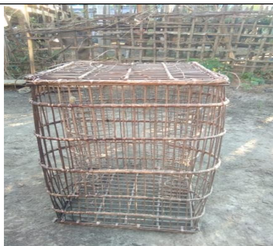
Rear view of Koliya