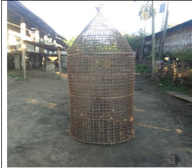
Vertical view of Dirdang