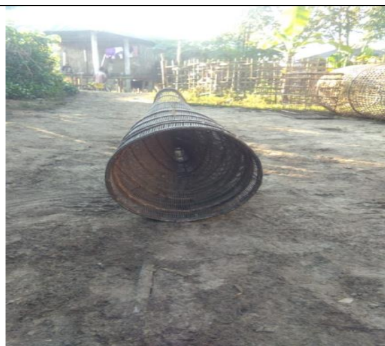
Horizontal view of Dingora